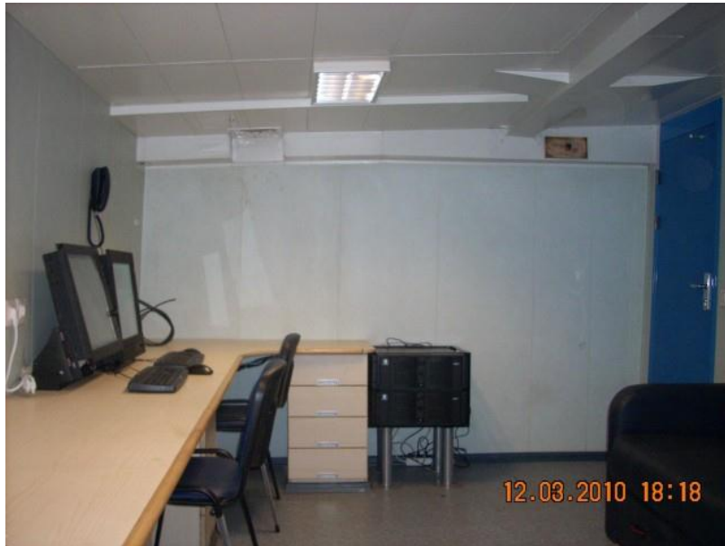
Online-offline survey room

Member of Danish Shipbrokers Association and Bimco